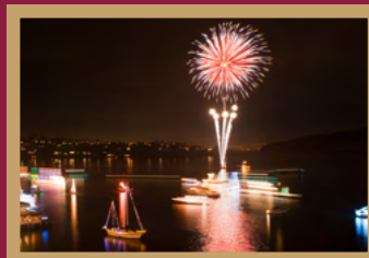
Parade of Lights See more on page 1.

Click here or scan the QR code for the English Newsletter Audio