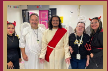
Halloween Highlights See more on page 3.