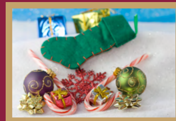
Stockings & Ornaments See more on page 2.